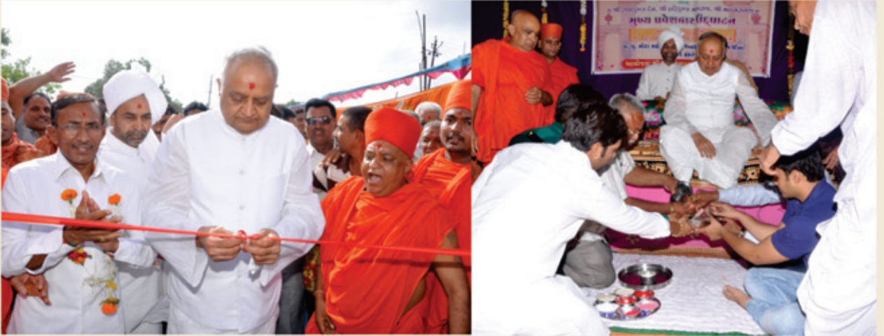
H.H Shri Mota Maharaj inaugurating Shree Radhakrishnadev Shri Mandavraiiji Entrance Gate in Muli temple and Haribhaktas performing poojan of H.H. Shri Mota Maharaj on the occasion of Guru Purnima in Muli temple.