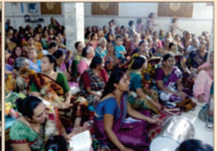
(1) H.H. Shri Lalji Maharaj blessing the devotees on the occasion of Katha Parayan organized during the pious Shravan Maas in Ahmedabad temple and the host devotee family. (2) Saints granting the benefit during Satsang Sabha organized at village Nandol on the occasion of Shree Narnarayandev Mahotsav. (3) Akhand Dhoon at village Dahegam on the occasion of Shree Narnarayandev Mahotsav. (4) Saints and Haribhaktas in Satsang Sabha organized at Ghamij on the occasion of Shree Narnarayandev Mahotsav. (5) Saints granting the benefit in the Satsang Sabha organized at Amja, Vagosana and Sardhav villages. (6) Satsang Sabha by the saints and 12 hour Akhand Dhoon by ladies devotees at Madhavgad (Talod) organized on the occasion of Shree Narnarayandev Mahotsav.