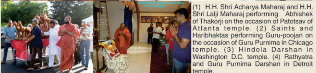
(1) H.H. Shri Acharya Maharaj and H.H. Shri Lalji Maharaj performing Abhishek of Thakorji on the occasion of Patotsav of Atlanta temple. (2) Saints and Haribhaktas performing Guru-poojan on the occasion of Guru Purnima in Chicago temple. (3) Hindola Darshan in Washington D.C. temple. (4) Rathayatra and Guru Purnima Darshan in Detroit temple.