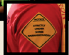
(1) H.H. Shri Lalji Maharaj blessing the young devotees in Camp organized by Shree Narnarayan Yuvak Mandal in Shree Swaminarayan temple, Byron (U.S.A.). (2) H.H. Shri Lalji Maharaj playing with colours with Haribhaktas during Rangotsav in Byron temple. (3) Saints-Haribhaktas performing aarti of H.H. Shri Lalji Maharaj on the occasion of Guru Purnima in Byron temple. (Notice 'Strictly under Shree Narnarayandev' displayed on the arm of young devotees attracted the attention of all.)